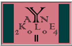
Family Gatherings - 50th Wedding Anniversaries and Weddings