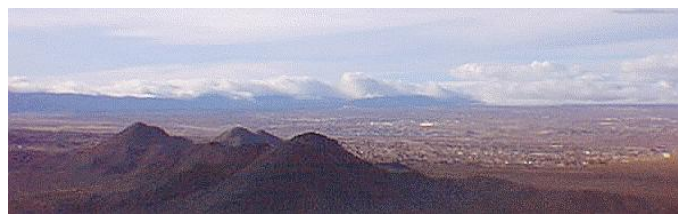
Panoramic view from Bell Mountain, overlooking Apple Valley, California